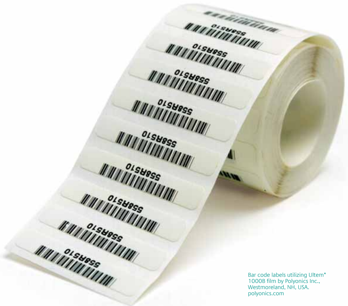
Bar code labels utilizing Ultem® 1000B film by Polyonics Inc., Westmoreland, NH, USA. polyonics.com

Hands-on engineering support for customers covers the numerous aspects of application development: from design reviews, prototyping and testing, to thermoforming, injection molding and in-mold decoration (IMD).