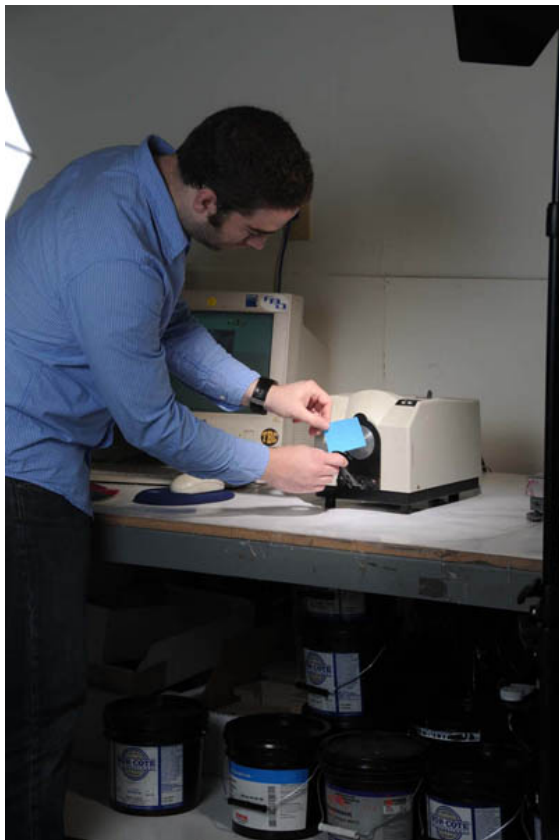
MSI In House Color Matching Dept. Since 1990