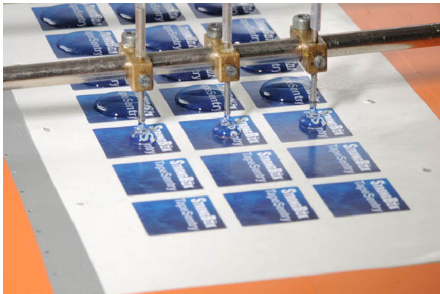
In House Doming