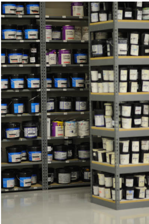
MSI Ink Files