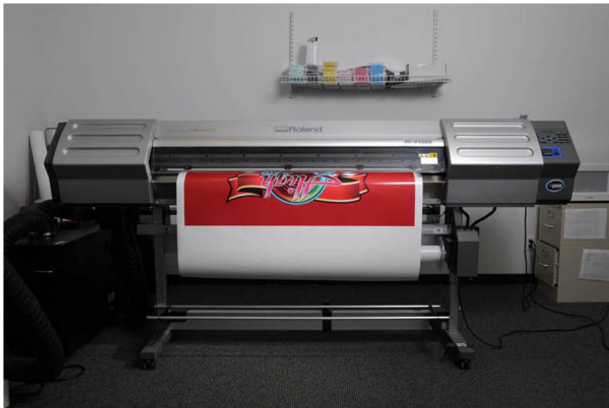
Sol-Jet Ink-Jet Digital Printer Size: 54 x unlimited length