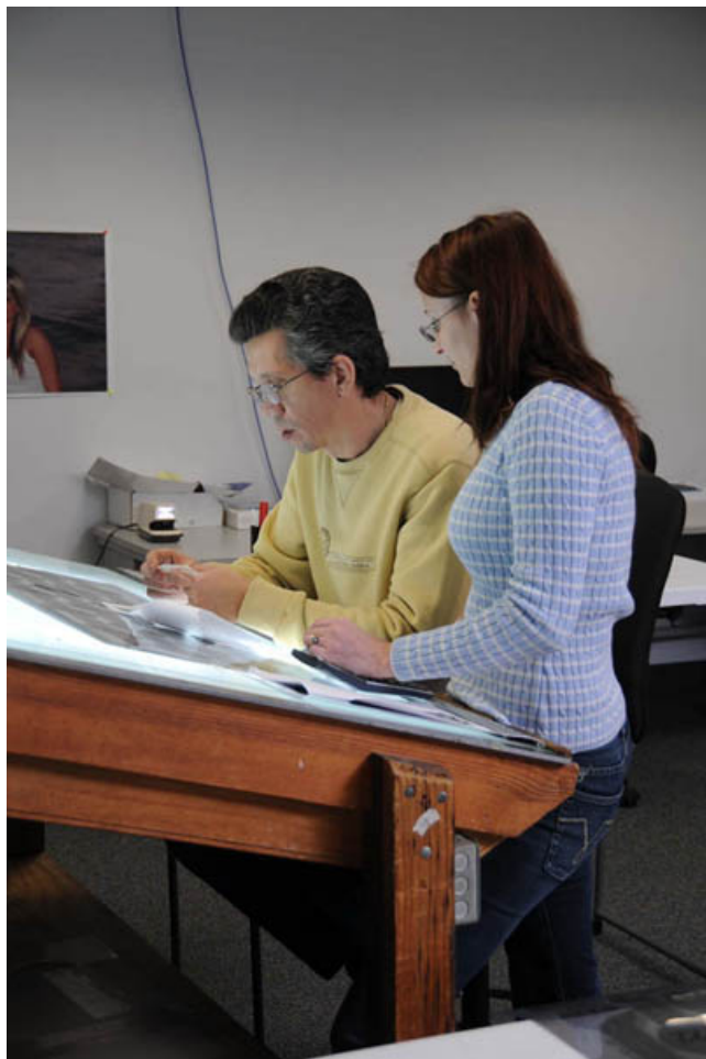
MSI Art Dept Final check before releasing to production