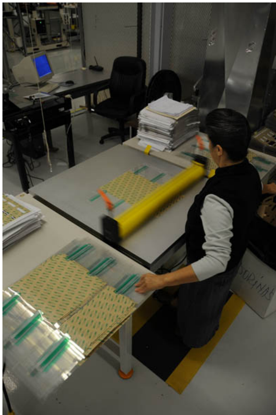
Membrane Switch Assembly