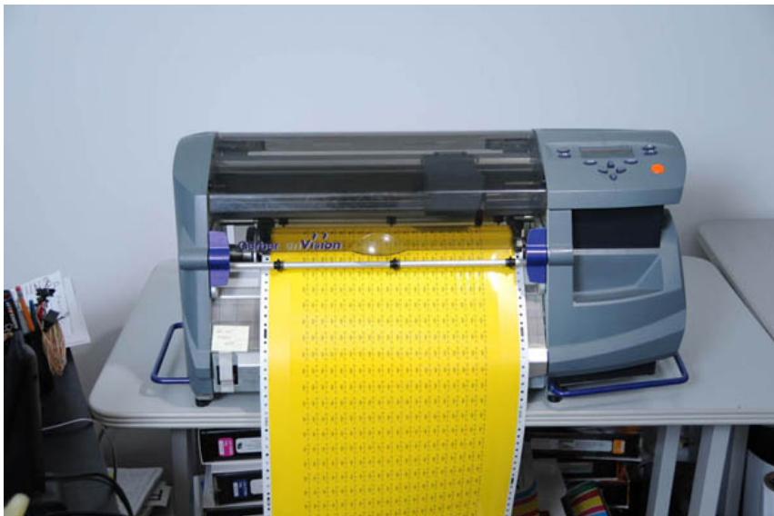
Gerber Digital Thermal Printer