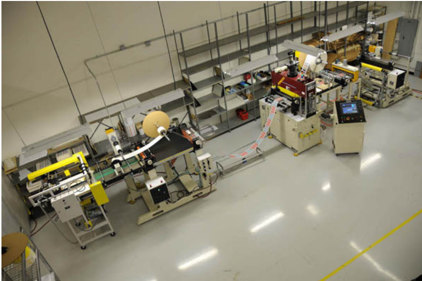
Preco Fully Automated Die Cutting Line Size: 10 x 16 Camera registration for tolerances of \pm .010 Excellent for runs of 50000+