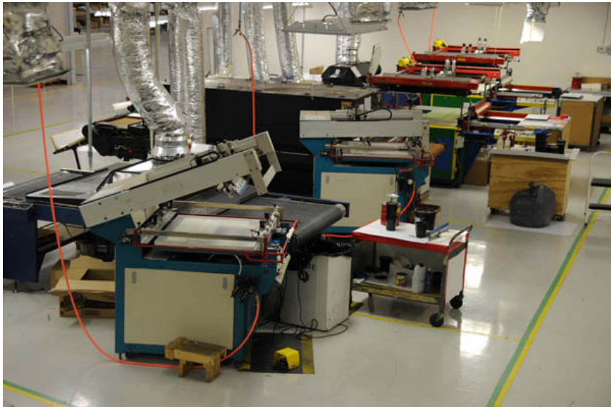
1 Color AWT Corp Screen Printing Press 16 x 24 MSI has 3 identical presses this style.