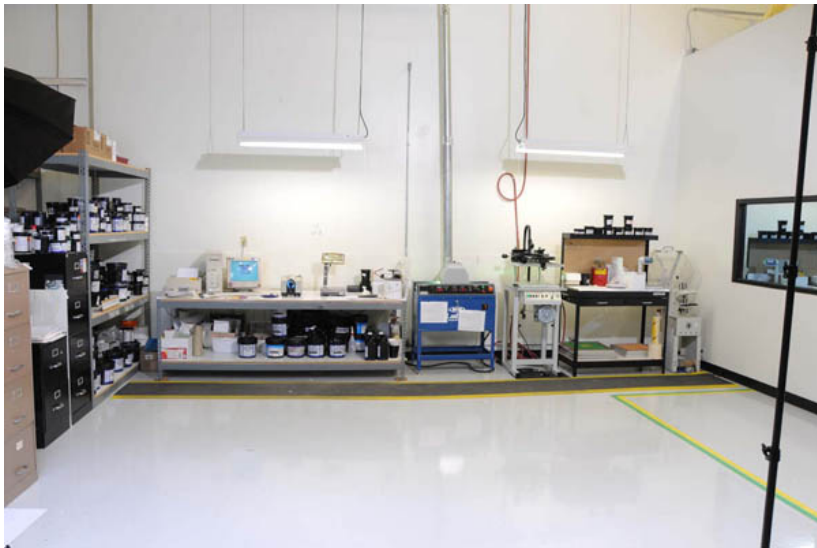
MSI Color Match Dept. Color matching computer Dedicated printer and dryer for color matching off-line.