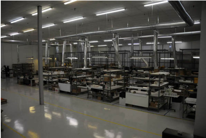
Inspection Department 10 stations