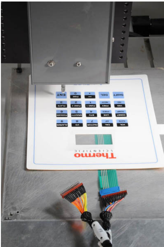
MSI In House Membrane Switch testing