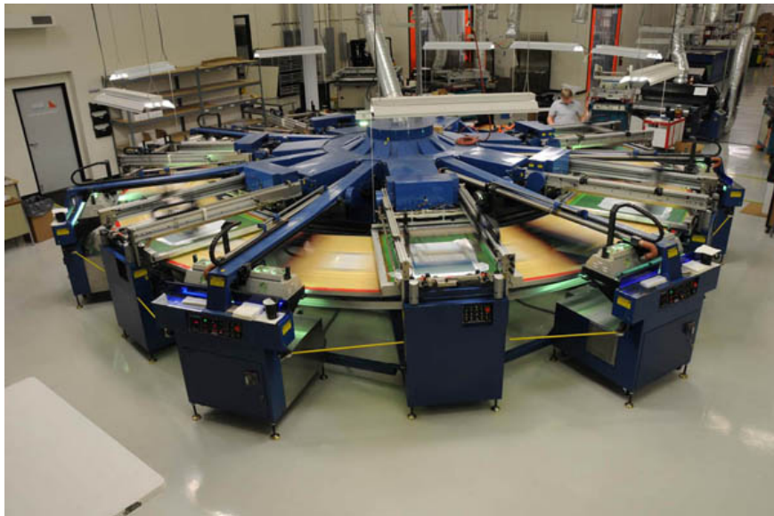
6 Color Carousel Screen Printing Press